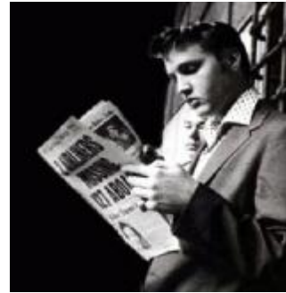
"There's Good Rocking Tonight"

News letter for members of the Official Elvis Presley Fan Club, Elvis-Aberdeen.