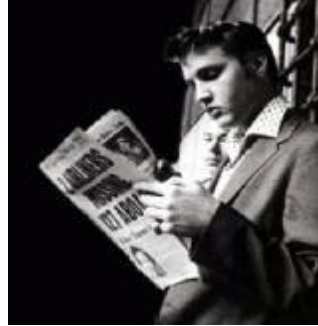
"There's Good Rocking Tonight"

News letter for members of the Official Elvis Presley Fan Club, Elvis-Aberdeen.