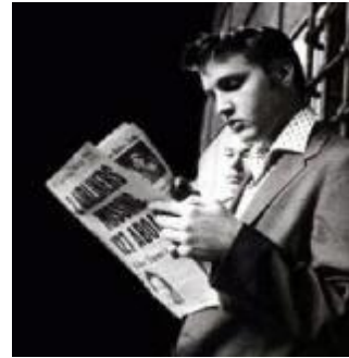
"There's Good Rocking Tonight"

News letter for members of the Official Elvis Presley Fan Club, Elvis-Aberdeen.