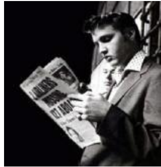
"There's Good Rocking Tonight"

News letter for members of the Official Elvis Presley Fan Club, Elvis-Aberdeen.